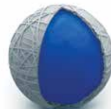
Contains the two most active isomers of the eight in cypermethrin.