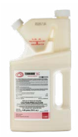
A.I. 9.1% Fipronil Packaged 20 oz., 78 oz., 2.5 gal.