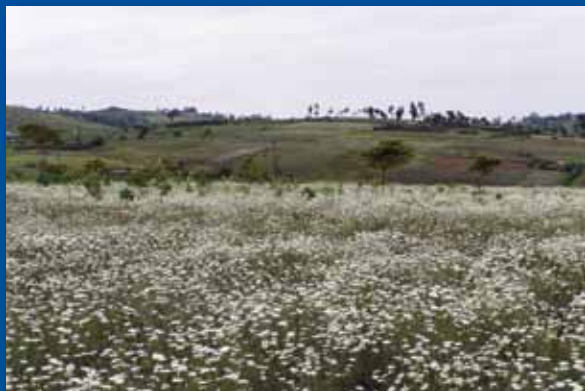
Pyrethrin is derived from Chrysanthemum cinerariaefolium.