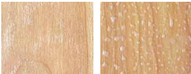
New Phantom pressurized insecticide Ordinary Spray

Compared to ordinary sprays that leave a residue, Prescription Treatment® brand Phantom ® pressurized insecticide delivers the active ingredient more effectively by drying in “crystals” without leaving a visible residue. It also provides superior performance on porous materials because the product remains on surface for pick up and transfer.