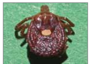
The four most common species of “wood ticks” are black-legged tick (first), Rocky Mountain spotted fever tick (second), American dog tick (third) and the lone star tick (fourth).